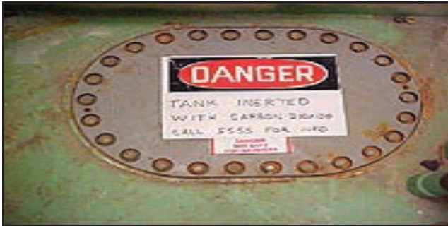
Photograph of proper signage used to indicate the designation of an enclosed or confined space.

The Confined or enclosed spaces on barges may have an atmosphere that is unsafe, causing injury or death. The main hazards include: oxygen deficiency, explosive or flammable atmospheres, and atmospheres containing toxic compounds. These hazards might be found in watertight compartments or other areas with little or no ventilation.