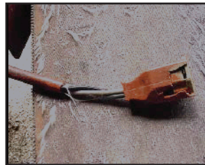
Photos showing damaged wiring that could cause an electrical fire if used.